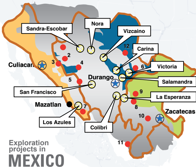
Exploration projects in MEXICO